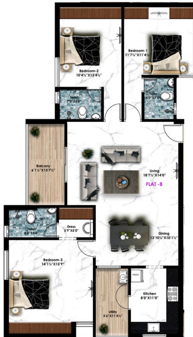
FIRST TO FIFTHB FLOOR PLAN FLAT-B1,B2,B3,B4&B5